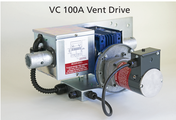
VC 100A Vent Drive